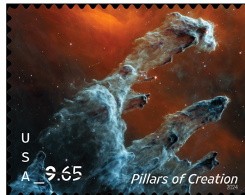
January 22 Pillars of Creation (Priority Mail) GREENBELT, MD 20770