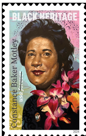
January 31 Forever Constance Baker Motley Black Heritage Series NEW YORK, NY 10199