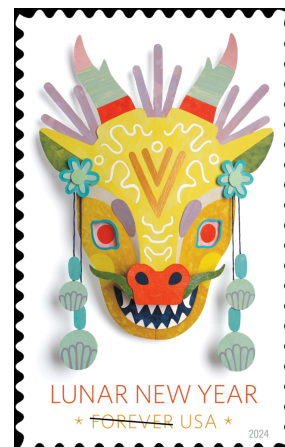
January 25 Forever Lunar New Year: Dragon SEATTLE, WA 98109