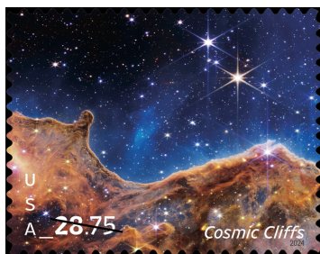
January 22 Cosmic Cliffs (Priority Mail Express) GREENBELT, MD 20770