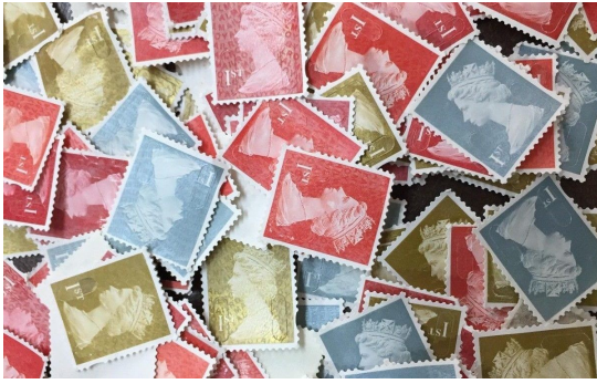
Security features intended to prevent the reuse of stamps aren't working, experts have warned

The news comes at a bad time for Royal Mail, which has seen its share price drop by 32 per cent since it issued a profit warning at the beginning of October. It is estimated that the industry could cost Royal Mail as much as £10m a year.