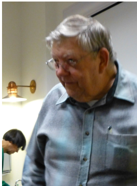
Some snapshots from the November club meeting from our unofficial club photographer!